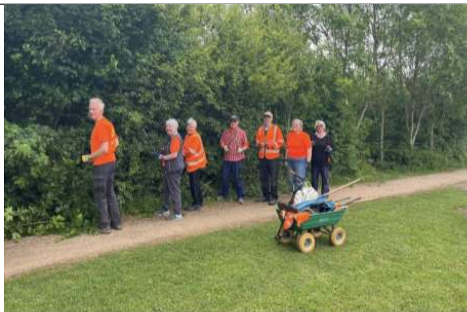
Trimming back the top path

Thanks to everyone that stopped to chat to us and say thank you for what we were doing both here and in other areas of the village - it makes our day