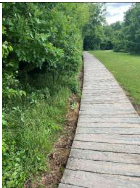
The raised walkway after the trim