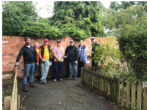
Thanks Team - Great work today in the rain