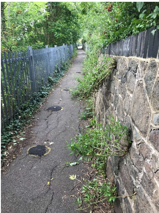
Before – lots of low laying growth along the path

It's a lovely long path so we could spread out nicely while getting the work done. And there was a lot to do. Luckily we were able to make use of a number of brown bins (curtesy of the Parish Council arranging them with Charnwood Borough Council – thanks to both) and we were soon filling them. Both sides of the path needed cutting back and there was a lot of leaf debris from both this year and previous years.