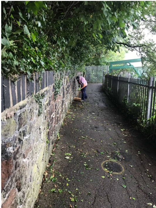
After - Bob sweeping up

After a good cut back the team were busy with the shovel, hoes, rakes and brushes getting rid of as much leaf debris as possible. Removing as much leaf litter as possible really does help to cut back on growth on the path in future years – but it's a lot of hard work.