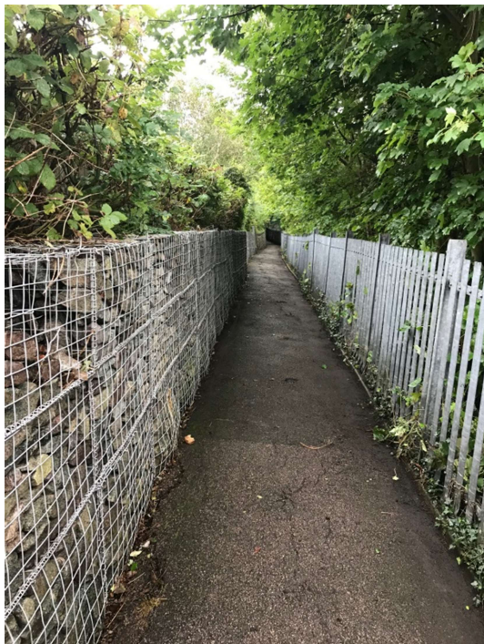
After - The cleared path towards the railway bridge

We filled the bins but did manage to clear the jitty all the way towards Rookery Close. We even managed to get the worse of the green overgrowth from ground level all along the path to Cotes Road.