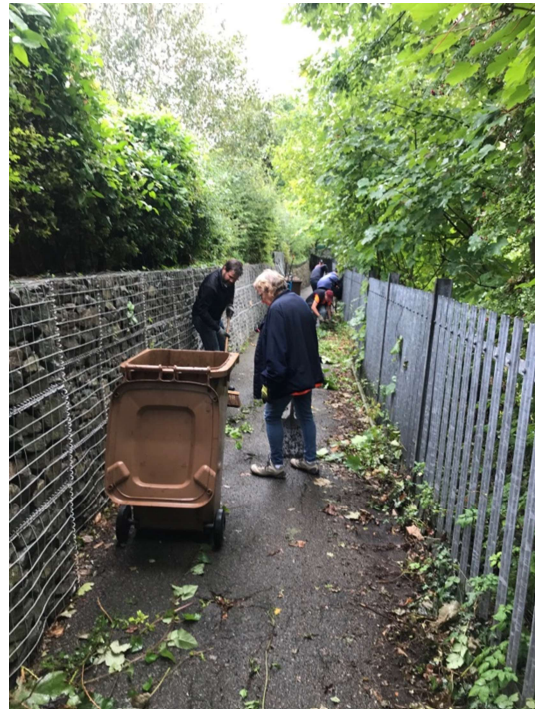
During - The other team at the top end of the jitty

We filled the bins but did manage to clear the jitty all the way towards Rookery Close. We even managed to get the worse of the green overgrowth from ground level all along the path to Cotes Road.